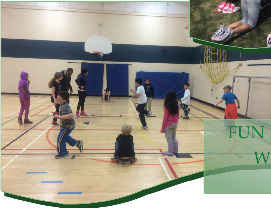
FUN AT THE POW WOW CLUB